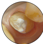
After 2 minutes, rinse away